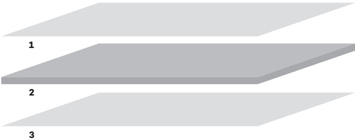
PLEXIGLAS® proTerra solid sheets with two coextrusion layers

• Collecting and sorting • Regranulating the residues and waste of semi-finished PLEXIGLAS® products